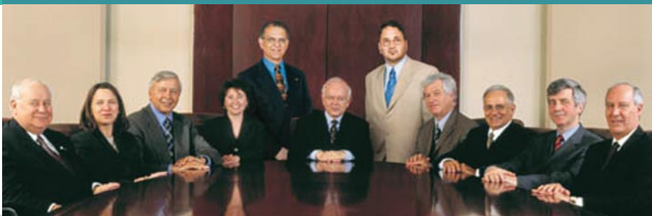
Board of Directors (from left to right):