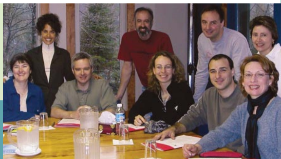
The Enviro-Access team from left to right, starting with the bottom row:

Bélanger Sauvé – Centre québécois de valorisation des biotechnologies (CQVB) Dessau-Soprin – École Polytechnique (affiliée à l'Université de Montréal) – Fasken Martineau DuMoulin – Goudreau Gage Dubuc – Grant Thornton – Groupe Bristol Group – Praxis Stratégie Communication – GSI Environnement – I.C.I. Environnement Jacques Whitford Environnement Limitée – KPMG – Lapointe Rosenstein – Le Fonds de solidarité des travailleurs du Québec – Le Groupe S.M. – Propage Créativité Marketing – Raymond Chabot Grant Thornton – TecSult Environnement – Université de Moncton – Université de Sherbrooke – Université Laval