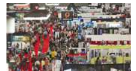
At Lavish SXSW Festival, Some Avoid Marketing Circus