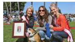
In This Beauty Pageant, the One With the Most Wrinkles Wins