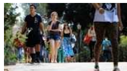
Colleges Straining to Restore Diversity