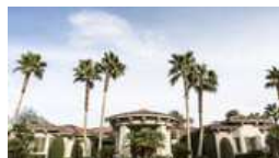
Big Deals in Las Vegas