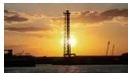
Energy Chiefs Sound Cost Alarms